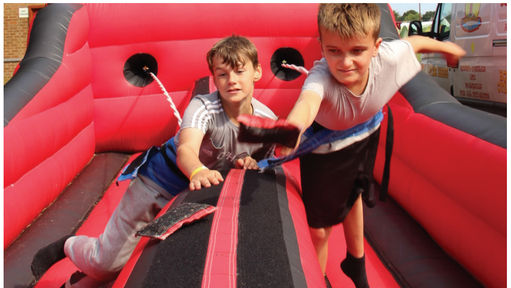
Photos from Norjam 2018, as a taster for what you can expect this week! Activities subject to change.